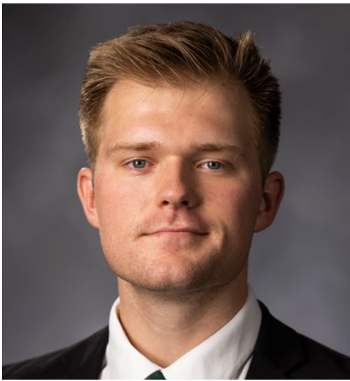
Remington Comp Cedar City, UT History