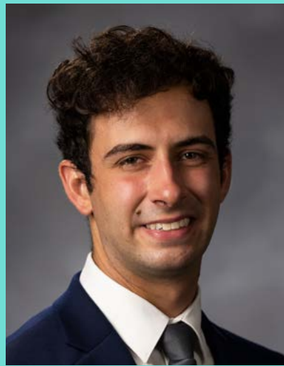
Brigham Vargha Photographer/ Videographer