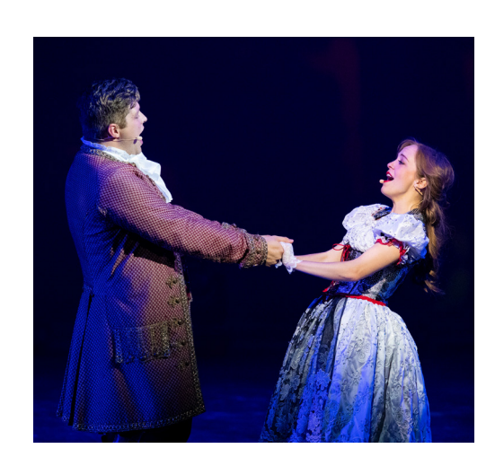
FOR IMMEDIATE RELEASE

(To get the text version of this file, visit pam.byu.edu/young-ambassadors)