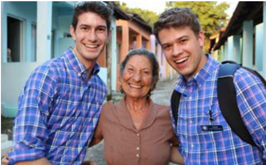
Members of the Young Ambassadors after a service project in Recife, Brazil.