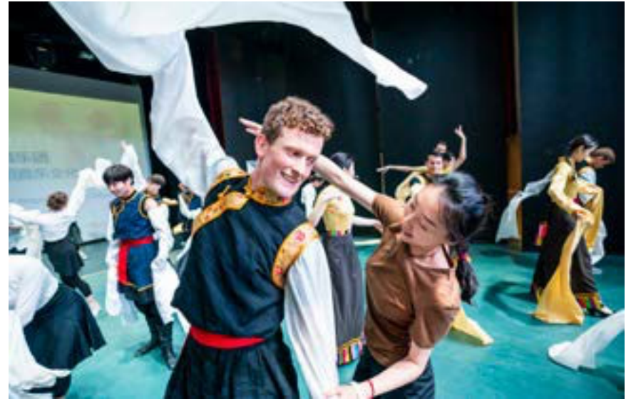
International Folk Dance Ensemble member learns a native Chinese dance in Beijing, China.

Responsible for all technical aspects of the performances. Assists tour manager in arranging for transportation of equipment. Responsible for set-up, strike, and equipment maintenance.