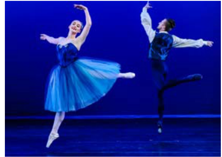
Members of Theatre Ballet give a performance of Carnival of the Animals.

Separate beds for single group members will be provided. Be respectful of the room you stay in. Keep valuables out of sight when the room is left unattended. Costs incurred other than the room rate, such as mini-bar usage, room service, laundry/dry-cleaning, internet, lost room keys, etc. are the responsibility of the individual and must be paid for before check-out.