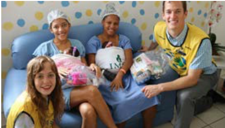
Members of Young Ambassadors at a service project in Belém, Brazil.

The vaccine is administered by injection. Adults should receive two separate doses with the second dose administered from 6-12 months after the first dose. Travelers are considered to be protected four weeks after receiving the initial vaccine dose. The vaccine series (both doses) must be completed for long-term protection. Estimates suggest that the vaccine may provide protective antibodies against hepatitis A for at least 20 years. Hepatitis A injections can be obtained from the Utah County Health Department, 151 South University Ave., Provo; 801-851-7000, https://health.utahcounty.gov/immunizations/