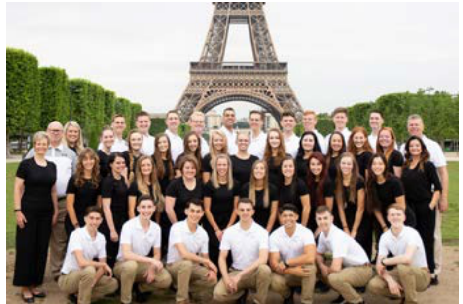
The Ballroom Dance Company in front of the Eiffel Tower.