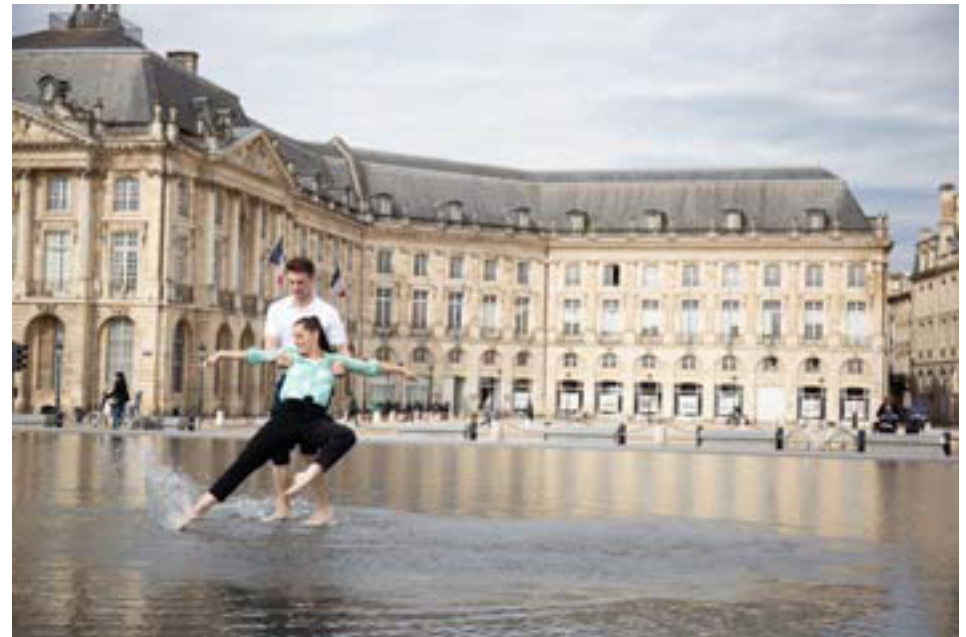
Members of the Ballroom Dance Company dance in the Miroir d'eau in Bordeaux, France.