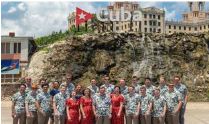
Synthesis poses in Havana, Cuba