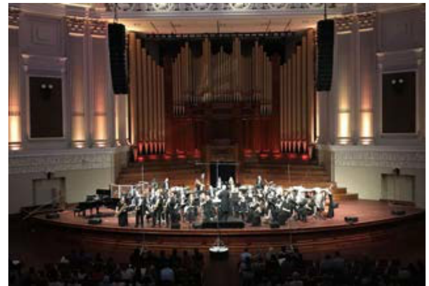
The Wind Symphony performs in Brisbane, Australia.