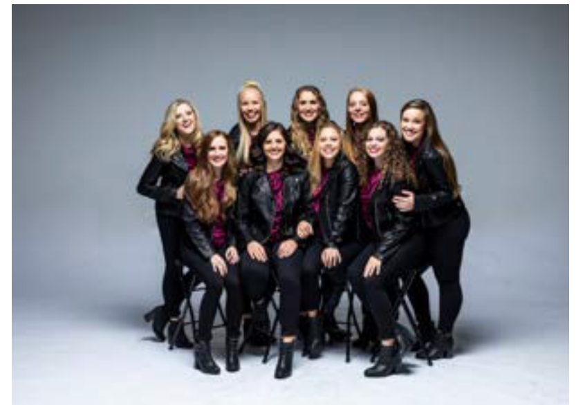
Members of Noteworthy in the 2021-2022 school year.