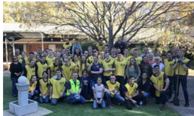
Members of the Wind Symphony after a service project in Sydney, Australia.