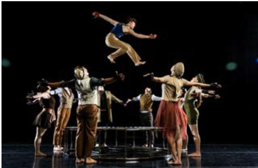
Contemporary Dance Theatre performs in Dance in Concert.

When making purchases, Visa, MasterCard, and American Express all have the significant advantage. They will charge you an exchange rate that is usually equal to or better than the rate you can get at a local bank or exchange office.