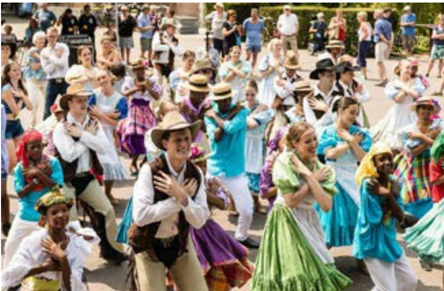
Members of the International Folk Dance Ensemble teach a dance at a festival in Schoten, Belgium.

Coordinated clothing components should be representative of BYU's dress and grooming standards and appropriate for the climate and occasion. If approved by the artistic director and chair, components such as T-shirts with BYU related symbols or logos, and conservative, modest shorts, may be included. Swimsuits must be modest in fabric, fit, and style.