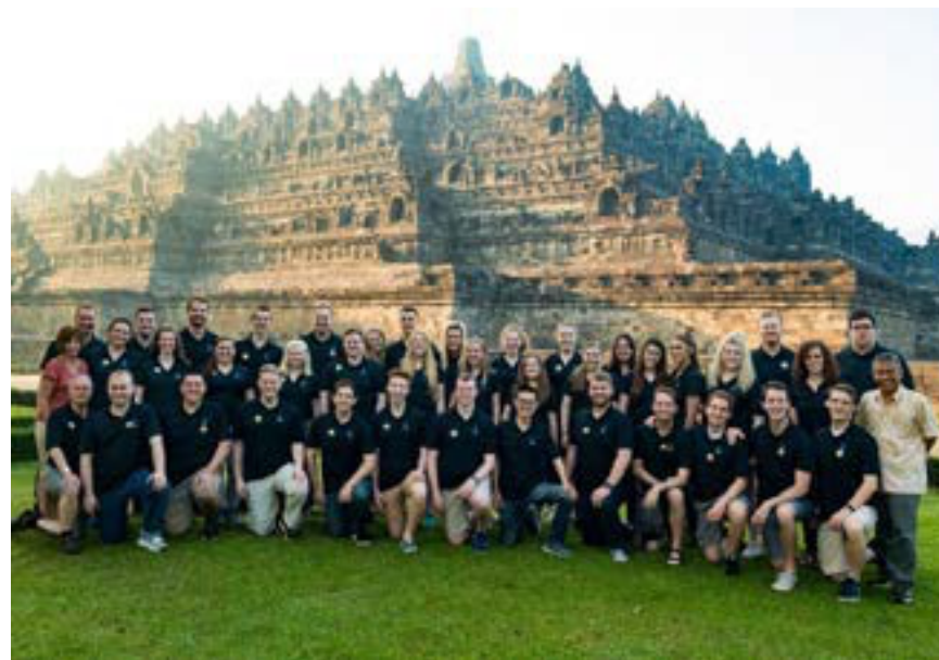
BYU Singers in front of the Borobudur Temple in Yogyakarta, Indonesia.

If you wish to fly to a city other than Salt Lake City at the end of the tour, you must notify Performing Arts Management at least four months prior to tour departure and complete the Tour Travel Deviation Application no