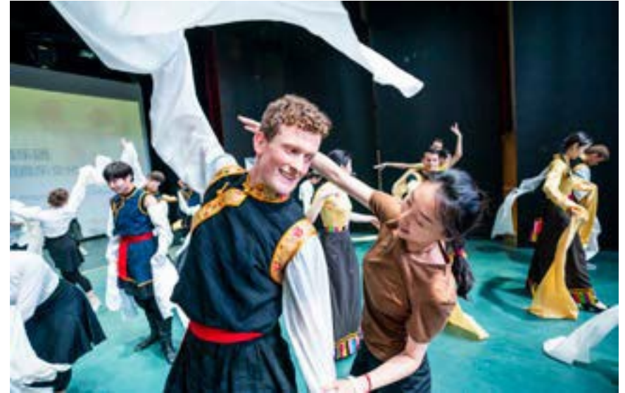
International Folk Dance Ensemble member learns a native Chinese dance in Beijing, China.

Responsible for all technical aspects of the performances. Assists tour manager in arranging for transportation of equipment. Responsible for set-up, strike, and equipment maintenance.