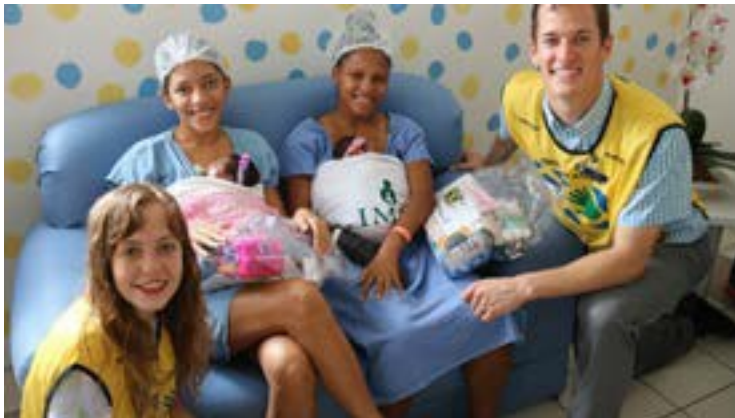
Members of Young Ambassadors at a service project in Belém, Brazil.

The vaccine is administered by injection. Adults should receive two separate doses with the second dose administered from 6-12 months after the first dose. Travelers are considered to be protected four weeks after receiving the initial vaccine dose. The vaccine series (both doses) must be completed for long-term protection. Estimates suggest that the vaccine may provide protective antibodies against hepatitis A for at least 20 years. Hepatitis A injections can be obtained from the Utah County Health Department, 151 South University Ave., Provo; 801-851-7000, https://health.utahcounty.gov/immunizations/