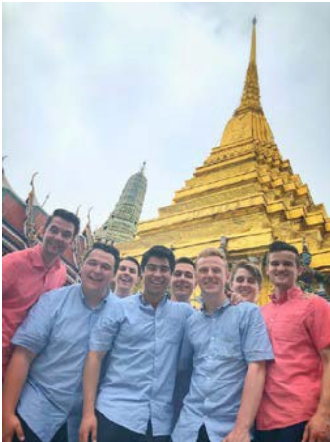
Vocal Point takes a photo in front of The Grand Palace in Bangkok, Thailand.

Members of performing ensembles are not allowed to drive vehicles belonging to presenters or local Church members while on tour. Whenever riding in a car, always wear a seat belt. If the opportunity presents itself for you to travel separately from the ensemble (i.e., with family members), you must complete an Assumption of Risk and Release Agreement first to obtain permission.