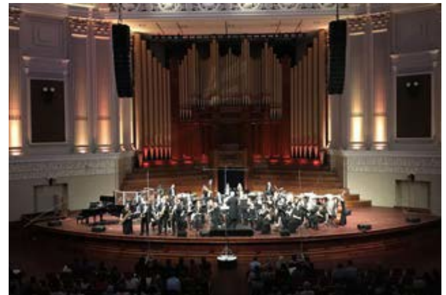
The Wind Symphony performs in Brisbane, Australia.