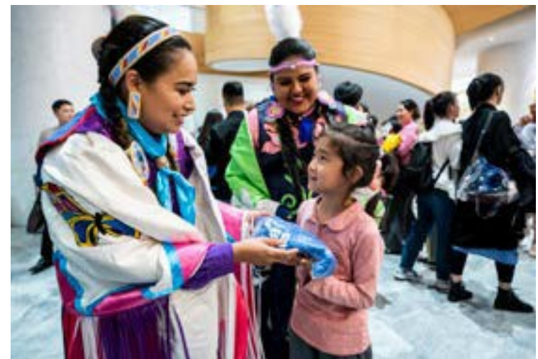
Living Legends member gives a t-shirt to an audience member after a performance in China.

Each performing ensemble and the individuals involved will realize their greatest potential as they successfully maintain a balance of these educational and spiritual goals.