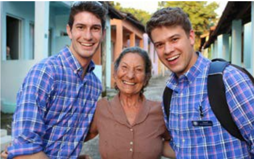
Members of the Young Ambassadors after a service project in Recife, Brazil.