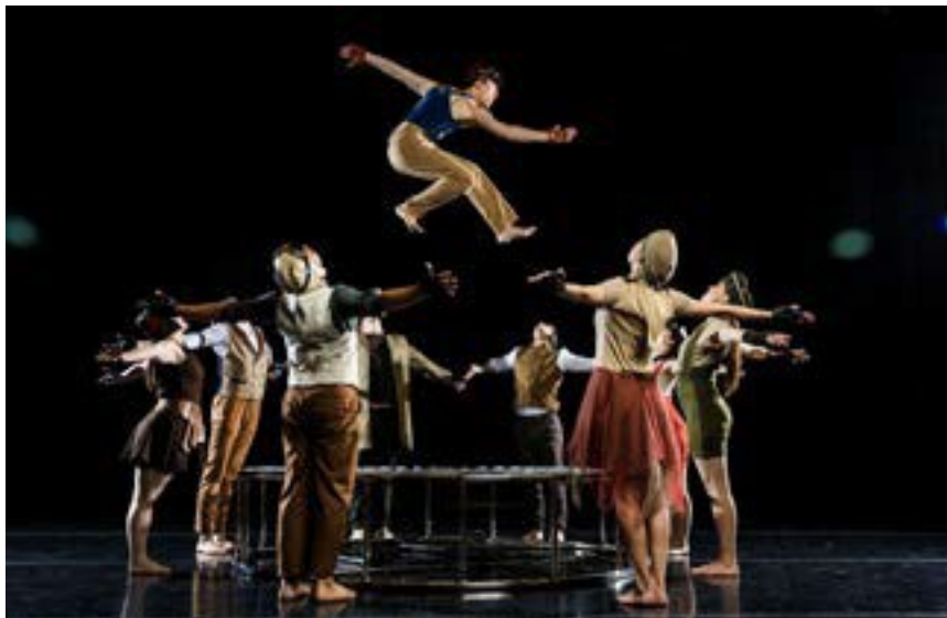
Contemporary Dance Theatre performs in Dance in Concert.

When making purchases, Visa, MasterCard, and American Express all have the significant advantage. They will charge you an exchange rate that is usually equal to or better than the rate you can get at a local bank or exchange office.