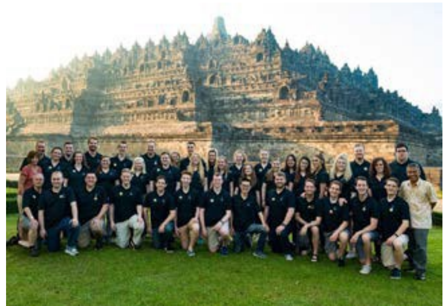
BYU Singers in front of the Borobudur Temple in Yogyakarta, Indonesia.

If you wish to fly to a city other than Salt Lake City at the end of the tour, you must notify Performing Arts Management at least four months prior to tour departure and complete the Tour Travel Deviation Application no