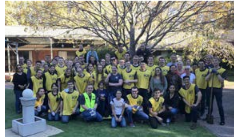
Members of the Wind Symphony after a service project in Sydney, Australia.