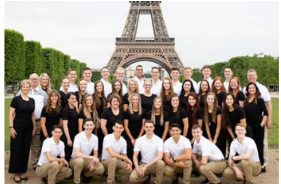
The Ballroom Dance Company in front of the Eiffel Tower.