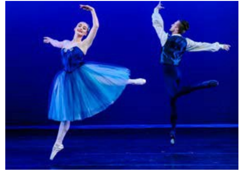
Members of Theatre Ballet give a performance of Carnival of the Animals.

Separate beds for single group members will be provided. Be respectful of the room you stay in. Keep valuables out of sight when the room is left unattended. Costs incurred other than the room rate, such as mini-bar usage, room service, laundry/dry-cleaning, internet, lost room keys, etc. are the responsibility of the individual and must be paid for before check-out.