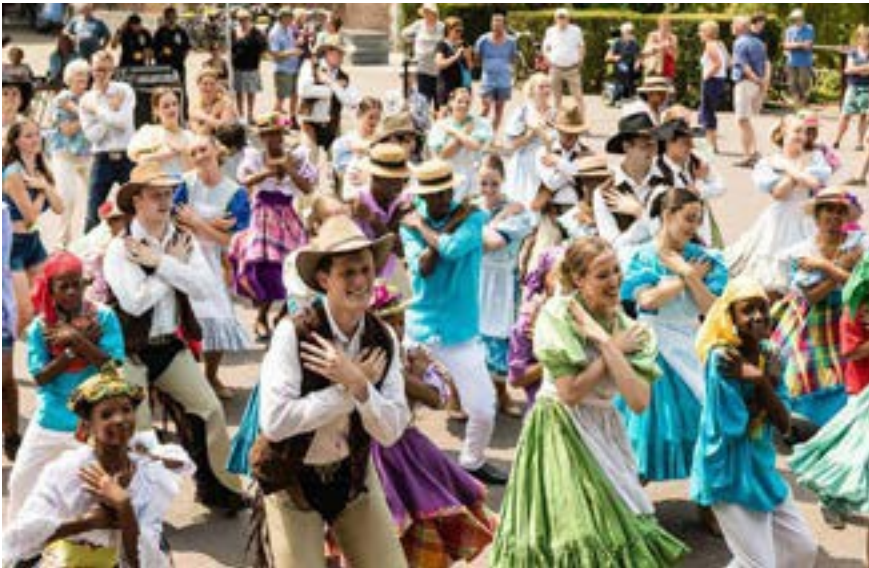
Members of the International Folk Dance Ensemble teach a dance at a festival in Schoten, Belgium.

Coordinated clothing components should be representative of BYU's dress and grooming standards and appropriate for the climate and occasion. If approved by the artistic director and chair, components such as T-shirts with BYU related symbols or logos, and conservative, modest shorts, may be included. Swimsuits must be modest in fabric, fit, and style.