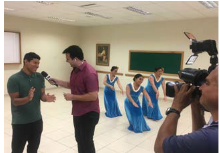
A Living Legends performer gives an interview in Brazil.