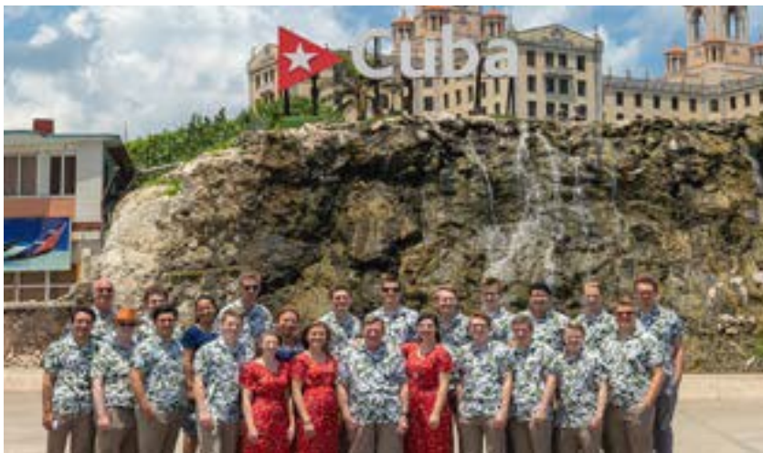
Synthesis poses in Havana, Cuba