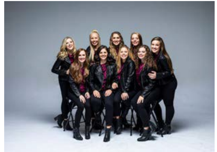
Members of Noteworthy in the 2021-2022 school