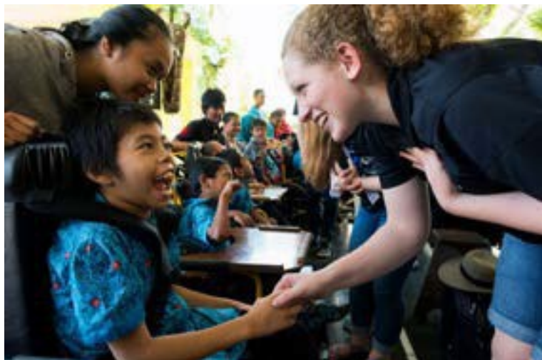
BYU Singers at an outreach performance in Yogyakarta, Indonesia.

If jet lag does not hit during your stay abroad, it may strike when you return home. This may be because it is finally catching up to you, because the