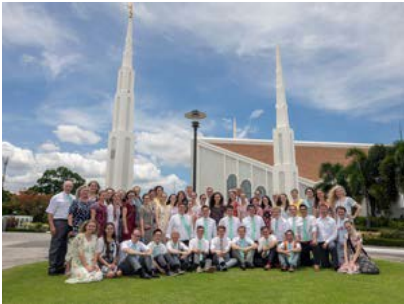
Chamber Orchestra at the Manila, Philippines Temple.

On this website you can also view benefit plans, view available doctors and hospitals specific to your country and location, download claim forms, check claim status, etc.