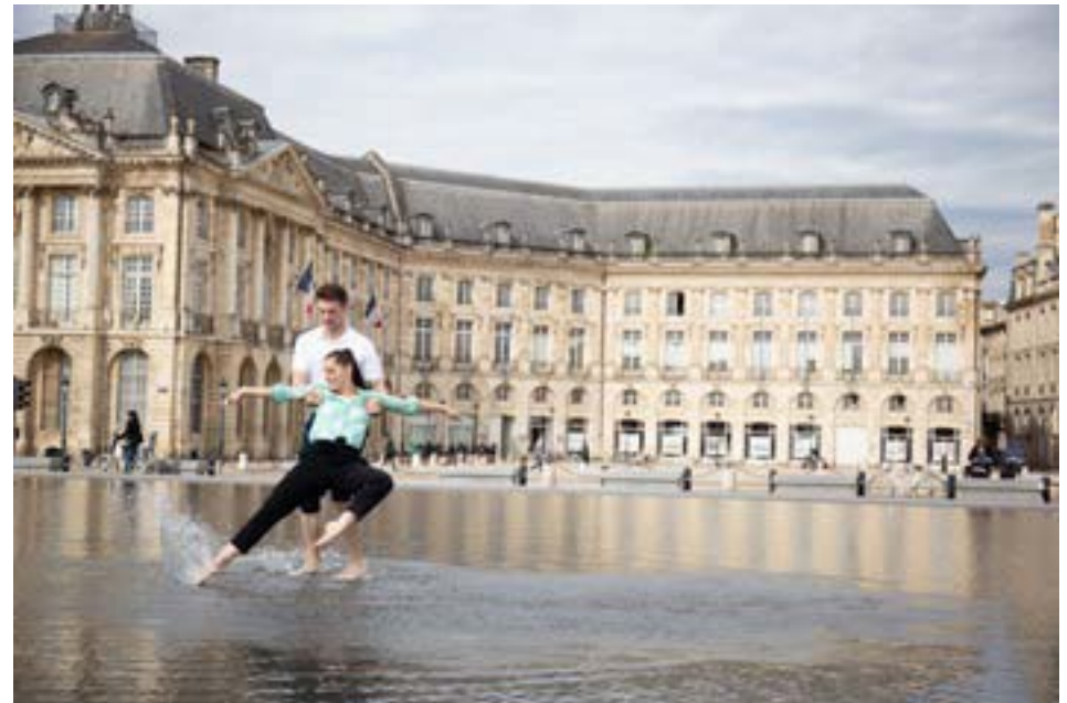
Members of the Ballroom Dance Company dance in the Miroir d'eau in Bordeaux, France.